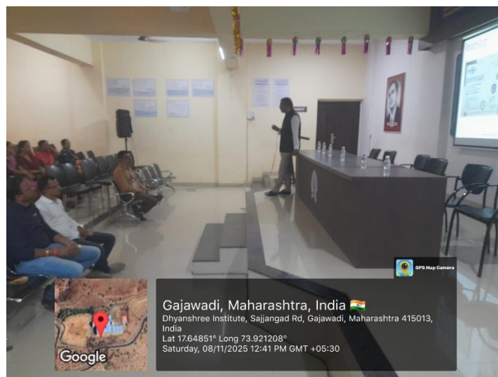
[Parent Meet. Dt-08/11/2025]