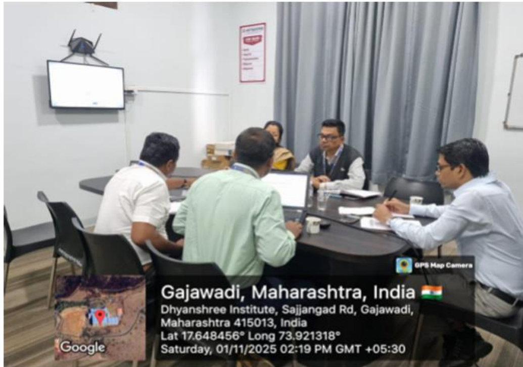
Online Departmental Advisory Committee meeting held on Saturday [Date: 1-11-2025]

3) Departmental Advisory Committee Meeting: A meeting has been held by the departmental advisory committee on 01-11-2025 to review the status of the curricular, co-curricular activities and also to discuss the future academic plans and execution.