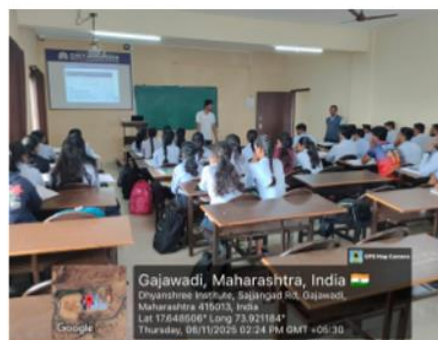
b) Students carefully listening the lecture. [Date:06/11/2025]